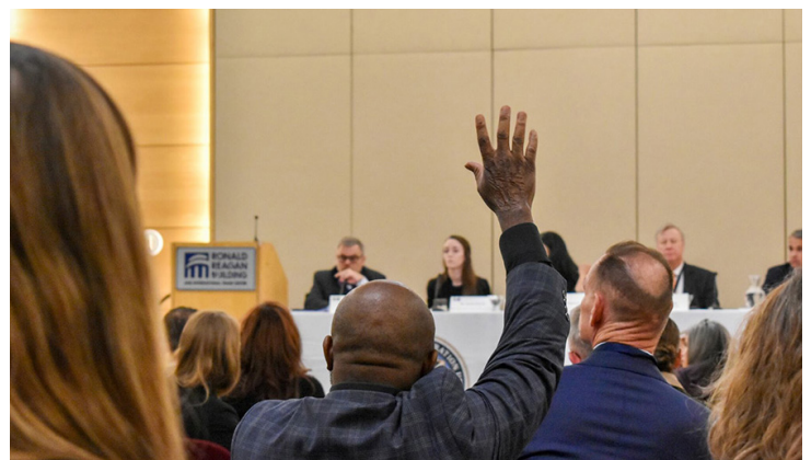
Participant raises his hand to ask the panel a question during the 2024 Security Cooperation Conference in Washington, D.C., Oct. 30, 2024. Participants engaged in planning, executing, administering, monitoring, assessing, and evaluating security cooperation programs and activities that support national defense and national security strategy objectives.