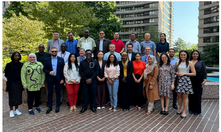
Locally Employed Staff (LES) members pose for a photo after completing DSCU's week-long Intermediate LES Course at DSCU facilities in the National Capital Region Sept. 9, 2024. Facilitated and mentored by faculty from DSCU's School of Security Cooperation Studies (SSCS) and Defense SCO Institute (DSI), the students learn through lectures, supported discussion, and hands-on exercises to practice their skills.