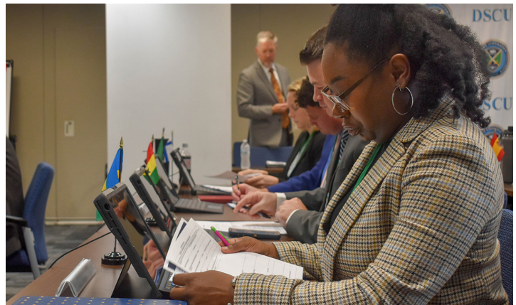
Security Cooperation Organization (SCO) students attend the inaugural DSI SCO qualification course in the National Capital Region. DSCU's DSI is the DOD SCO schoolhouse and offers tailored education and training to SCO personnel, their families, and LES.