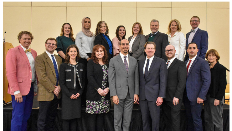
DSCU's conference organizers pose for a photo after the closing ceremony of the 2024 Security Cooperation Conference in Washington, D.C., Oct. 30, 2024. DSCU's Young Institute fosters analysis, research, scholarship, and critical inquiry that advances the field of security cooperation, enables application of lessons learned, and promotes evidence-based decision-making.