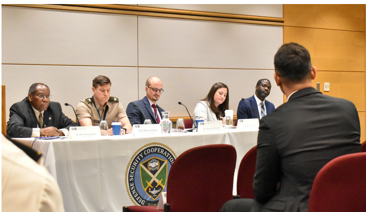
An attendee poses a question to the panel during a session at the 2024 Security Cooperation Conference in Washington, D.C., Oct. 28, 2024. DSCU's Security Cooperation Conference brings together experts and stakeholders to discuss advancements in security cooperation and strengthen international partnerships.