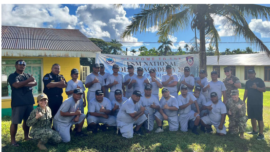
A team from DIILS poses for a photo after conducting an executive seminar on Human Rights and the Law of Armed Conflict at the Federated States of Micronesia Oct. 16, 2024.

ISG Women, Peace, and Security in Peacekeeping Operations Course