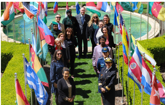
A cohort of graduates pose for a photo after completing the ISG's "Women, Peace, and Security in Peacekeeping Operations" course Sept. 20, 2024. The course enables participants to effectively implement the United Nation's Women, Peace, and Security (WPS) agenda in ongoing peacekeeping missions.