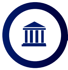
SECURITY GOVERNANCE & CIVIL MILITARY RELATIONS (CMR)

ISG's tailored education and professional development programs support the sustainment of a comprehensive knowledge base and strengthen partner capacities to confront complex security and defense challenges. Engagements are designed to cultivate individual understanding of complex issues, foster peer-to-peer learning, and build international communities of interest.