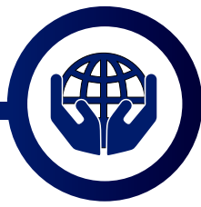
CONFLICT, TERRORISM, & PROTECTION (CTP)