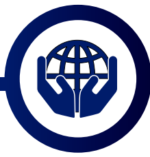
CONFLICT, TERRORISM, & PROTECTION (CTP)