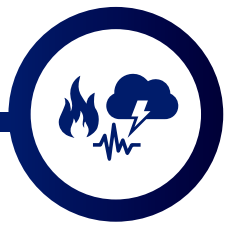
EMERGENCY MANAGEMENT & RESILIENCE (EM&R)