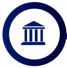
SECURITY GOVERNANCE & CIVIL MILITARY RELATIONS (CMR)

ISG's tailored education and professional development programs support the sustainment of a comprehensive knowledge base and strengthen partner capacities to confront complex security and defense challenges. Engagements are designed to cultivate individual understanding of complex issues, foster peer-to-peer learning, and build international communities of interest.