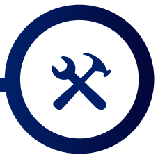
LOGISTICS CAPABILITY BUILDING (LCB)