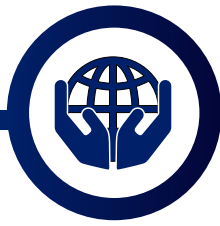
CONFLICT, TERRORISM, & PROTECTION (CTP)