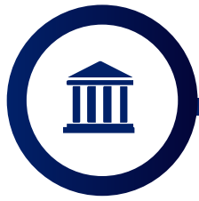
SECURITY GOVERNANCE & CIVIL MILITARY RELATIONS (CMR)

ISG's tailored education and professional development programs support the sustainment of a comprehensive knowledge base and strengthen partner capacities to confront complex security and defense challenges. Engagements are designed to cultivate individual understanding of complex issues, foster peer-to-peer learning, and build international communities of interest.