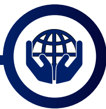
CONFLICT, TERRORISM, & PROTECTION (CTP)