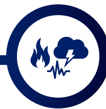
EMERGENCY MANAGEMENT & RESILIENCE (EM&R)