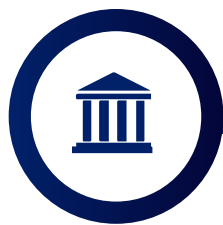
SECURITY GOVERNANCE & CIVIL MILITARY RELATIONS (CMR)

ISG's tailored education and professional development programs support the sustainment of a comprehensive knowledge base and strengthen partner capacities to confront complex security and defense challenges. Engagements are designed to cultivate individual understanding of complex issues, foster peer-to-peer learning, and build international communities of interest.