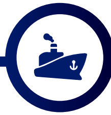
MARITIME SECURITY (MARSEC)