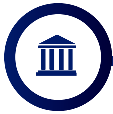
SECURITY GOVERNANCE & CIVIL MILITARY RELATIONS (CMR)

ISG's tailored education and professional development programs support the sustainment of a comprehensive knowledge base and strengthen partner capacities to confront complex security and defense challenges. Engagements are designed to cultivate individual understanding of complex issues, foster peer-to-peer learning, and build international communities of interest.