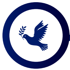
PEACEKEEPING & EXERCISES (PKX)