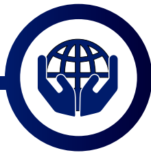
CONFLICT, TERRORISM, & PROTECTION (CTP)