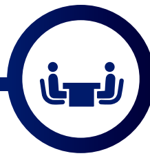
INTERNATIONAL DEFENSE ACQUISITION RESOURCE MANAGEMENT (IDARM)