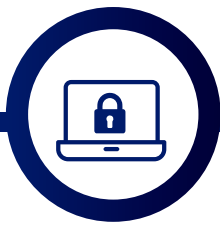
CYBER CAPABILITY (CYBER)